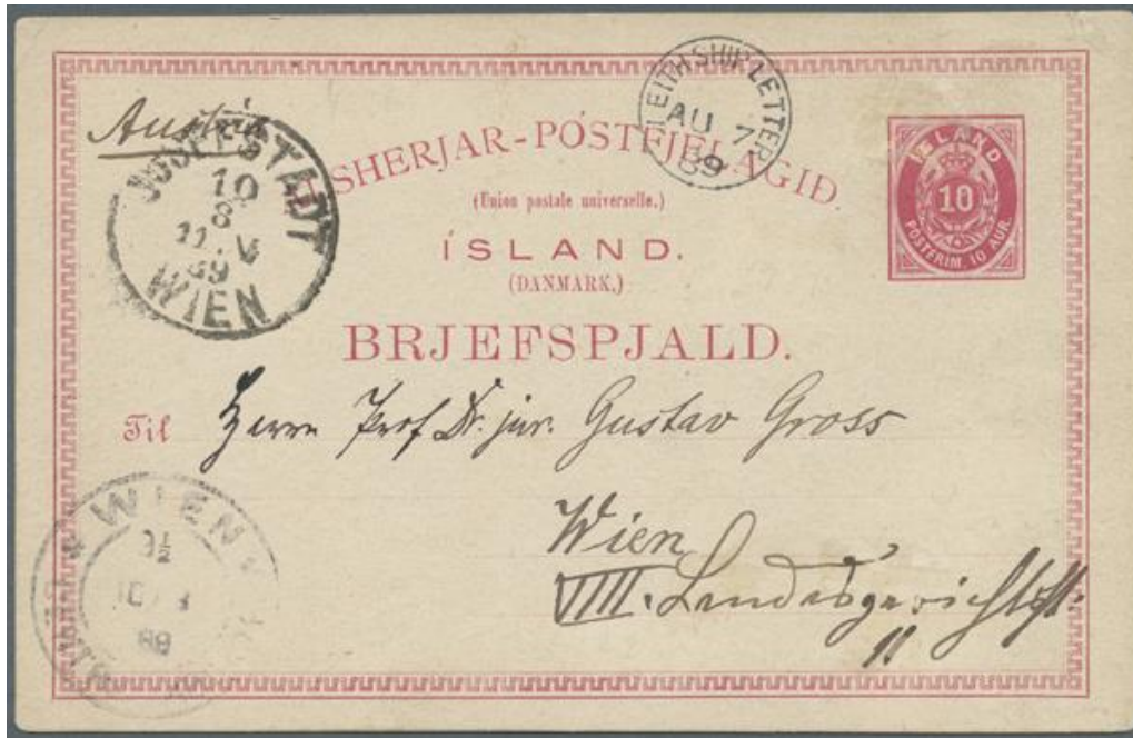
Stationary from Akureyri 30 JY 1889. (date on the back) to Vienna with LEITH SHIP LETTER AU 7 89. No postal treatment in Iceland.