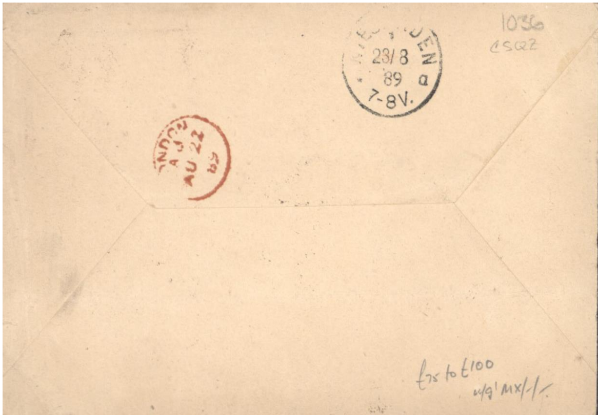
The LONDON stamp is also interesting - not being the LONDON SHIP LETTER used from 1890 7