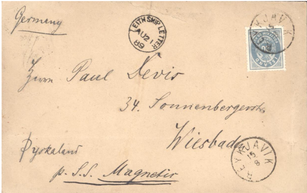
With "S.S. Magnetic" via Leith – LEITH SHIP LETTER AU 21 89 and LONDON AU 22 89 to Wiesbaden Germany 23/8.