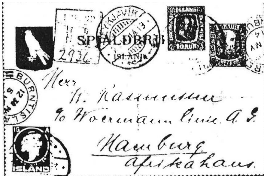
A single copy from 1. NO 1914: